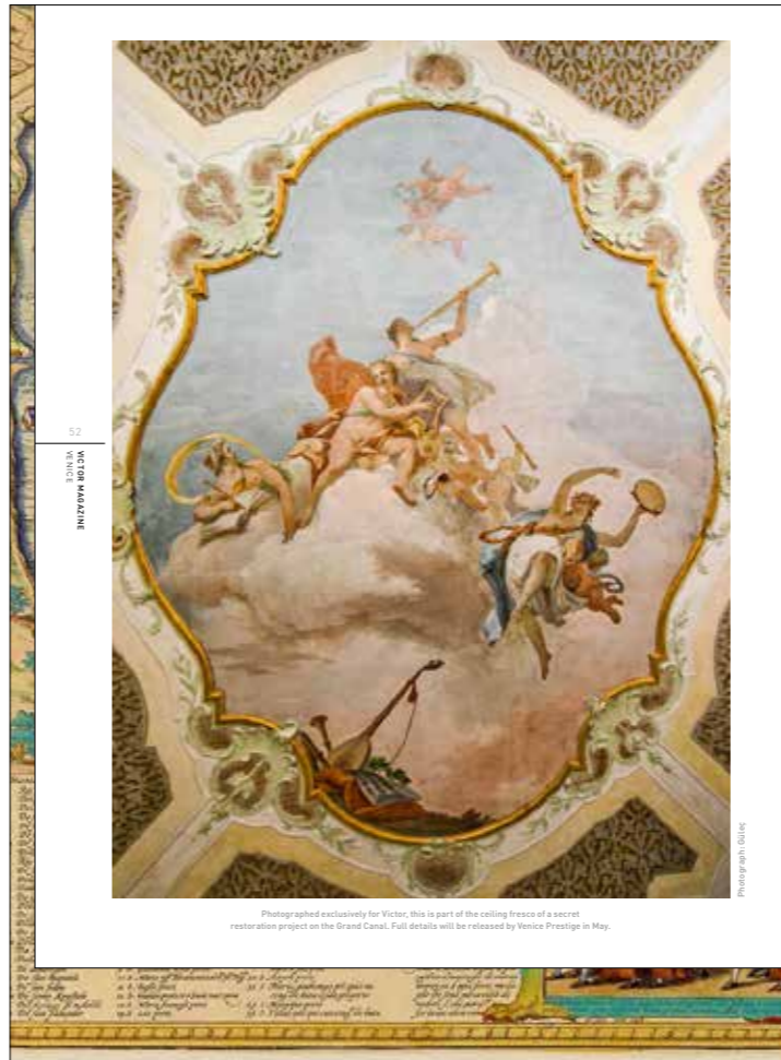
Photographed exclusively for Victor, this is part of the ceiling fresco of a secret restoration project on the Grand Canal. Full details will be released by Venice Prestige in May.